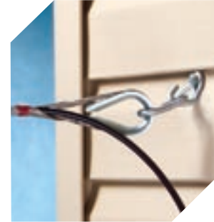
C-Link Adaptor & Thimble

2 Dead-ends Can be used for flat profile. Contact PLP® for more details.