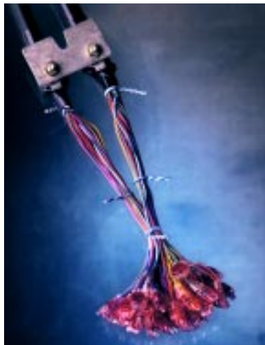
Splice bundle with individual connectors

The BLACK-JACK 25-Pair Cable Closure is available in both the traditional butt splice version and the in-line splice version. The 50-pair cable closure is designed to incorporate both butt and in-line capabilities with one design. The in-line version can be used for straight through or branch splice applications. Both designs offer the same reliable service, are easily re-entered and must be replaced after re-entry.