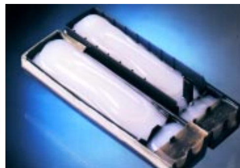
25-Pair Butt Version, Cat. No. 8006318

has hinged V-notch flaps which adjust and support various diameter cables.